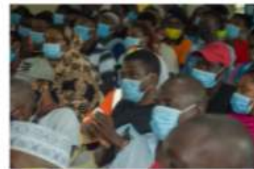
Right: IRCK ED addressing the Youth