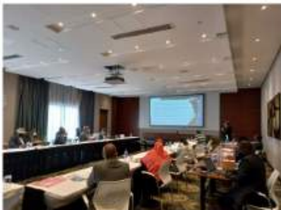
Below: RIs during the SIR Report Launch