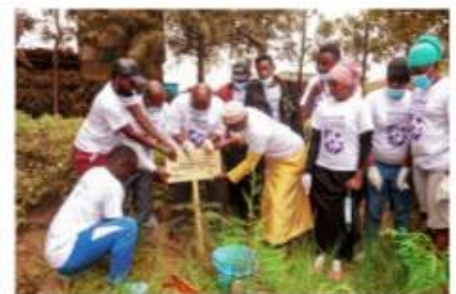
Above: Nairobi Youth Planting trees Right: Mombasa Interfaith Youth Planting trees in different activities.